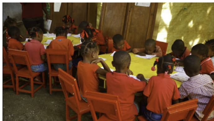
AFTER NEW FURNITURE FROM GMP