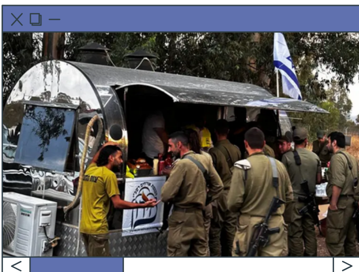
Free Food for Reserves Soldiers