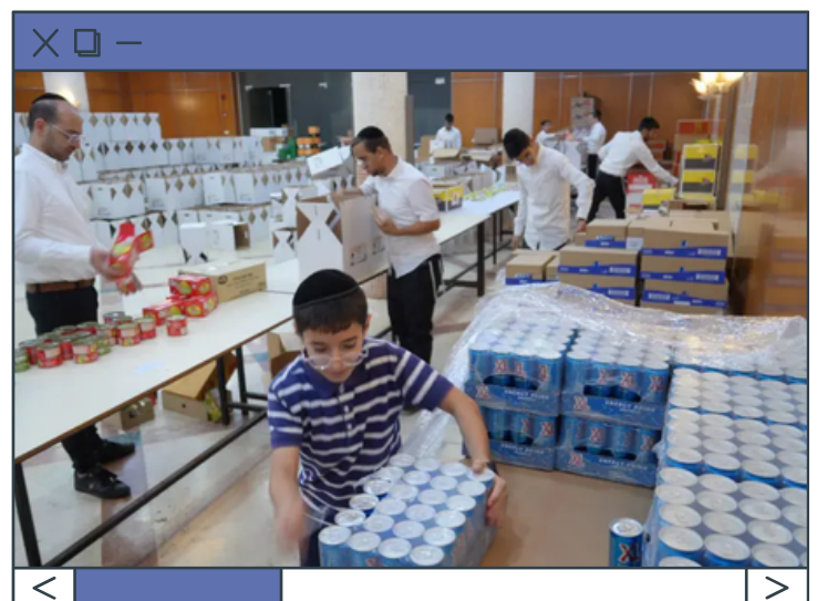
Orthodox Organization Packing Food for Soldiers