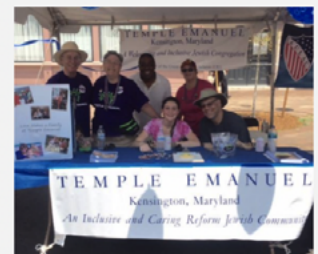
Kulanu events throughout the years