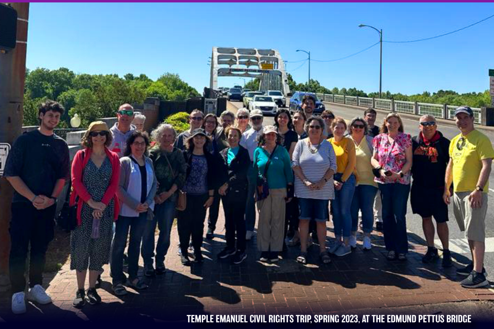
TEMPLE EMANUEL CIVIL RIGHTS TRIP, SPRING 2023, AT THE EDMUND PETTUS BRIDGE

The Newsletter of Temple Emanuel Kensington, Maryland