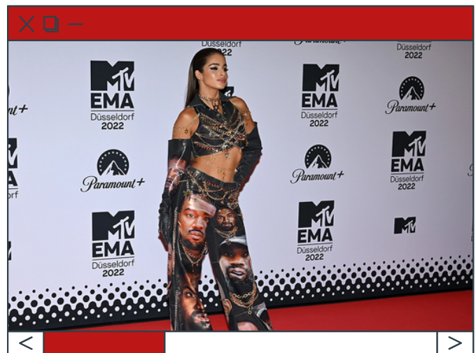
Kirel at the 2022 EMA's with the Famous "Kanye" Inspired Look