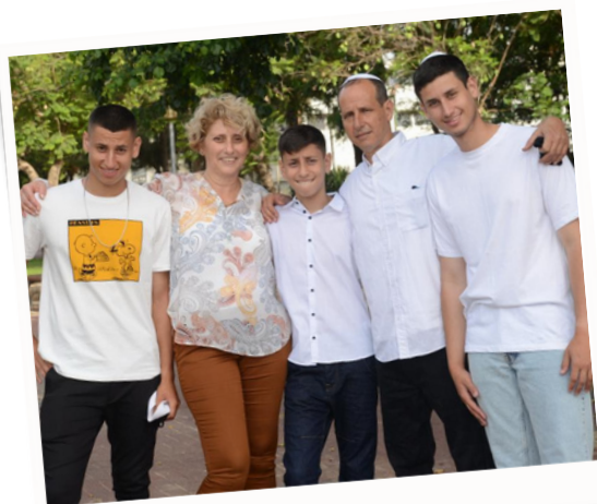
Left: my parents, brothers and I at my Brother's Bar-Mitzvah in 2020

When I left Israel my family got my a Hamsa to hang up in my apartment with the engraving "אין מקום ש'הוא רחוק מידי", which means that there's no place that is too far, and here I am celebrating with them miles apart, so until we reunite in August - Happy Birthday Mom and Dad! Love you a lot!