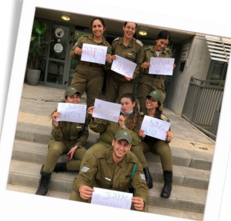
Right: IDF colleagues and I with signs celebrating my mom's birthday in 2020