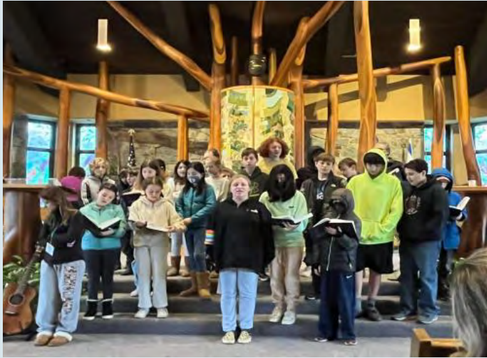
5TH GRADE LEADING V'AHAVTA