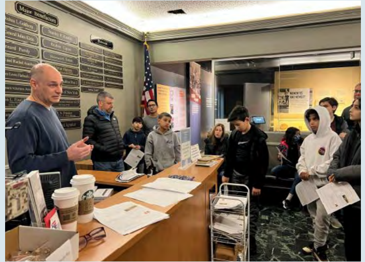
6TH GRADE VISITS THE NMAJMH

We also welcome the return of field trips! On January 22, 2023, our 6th Graders traveled to the National Museum of American Jewish Military History in Washington, DC. The purpose of the museum is to document and preserve the contributions of Jewish Americans to the peace and freedom of the United States and to educate the public concerning the courage, heroism, and sacrifices made by Jewish Americans who served in the armed forces. Students and parents had a private tour of the museum and viewed its collection of artifacts.